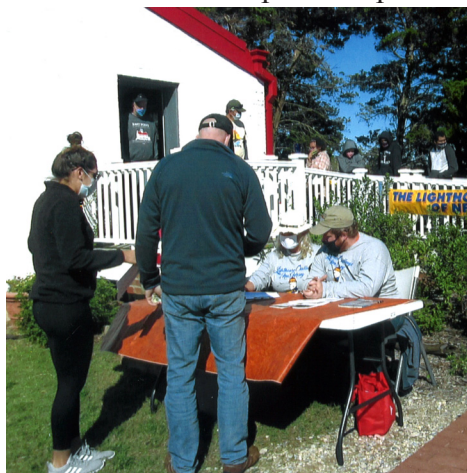
(Above) Signing up for a tour

The Executive Committee is planning to meet sometime between or after the holidays to plan our 2021 agenda. You will be notified of the organization's schedule in the spring newsletter. PLUS, we just have to name those newborn spats. Hope to see you all soon. Happy Holidays.