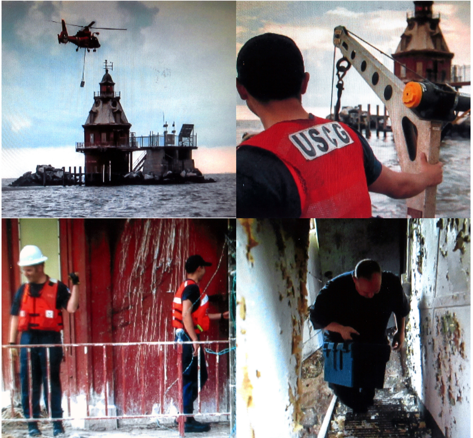
Coast Guard renovating Ship John Shoal Light (2020).

The captain and the crew hurriedly commenced hauling off the cargo. Heavy ice on the bay sliced through the vessel's hull sealing its doom. Hence, SHIP JOHN SHOAL (and eventually the Lighthouse) was named in memory of the ship that sank on the once unnamed shoal. (Information from Internet 2020)